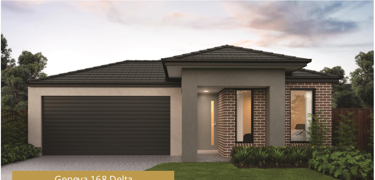
Geneva 168 Delta