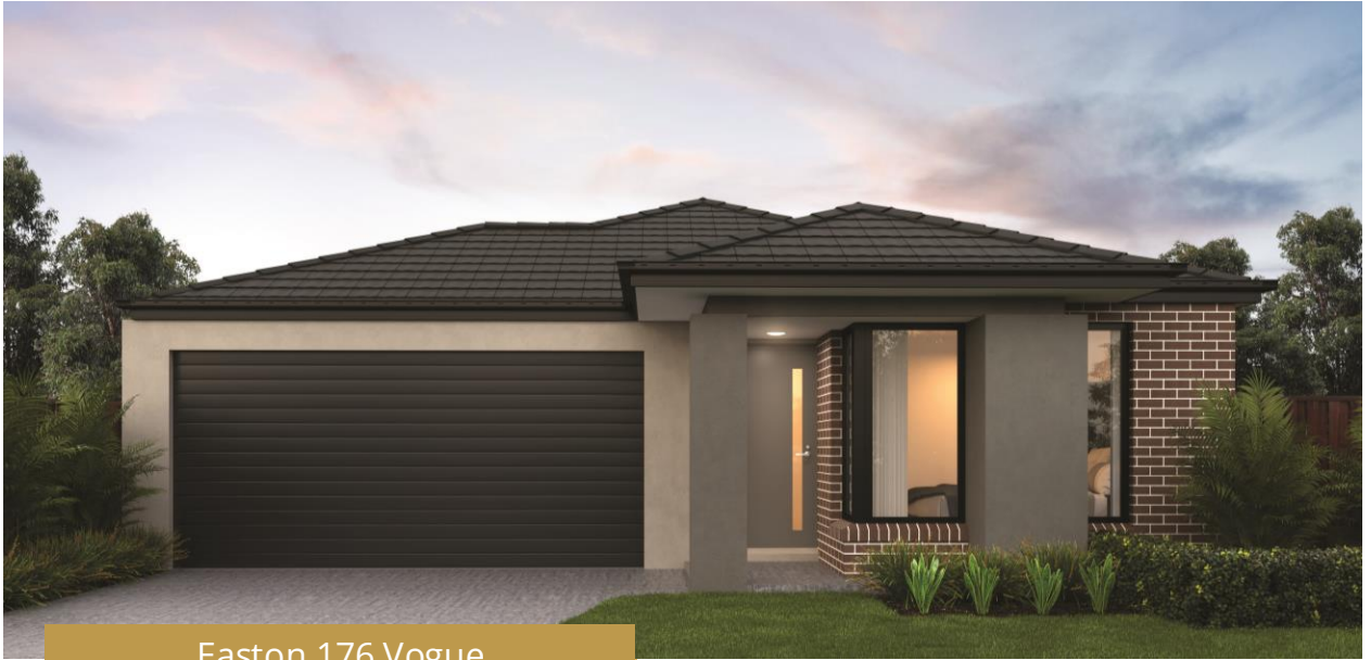
Easton 176 Vogue