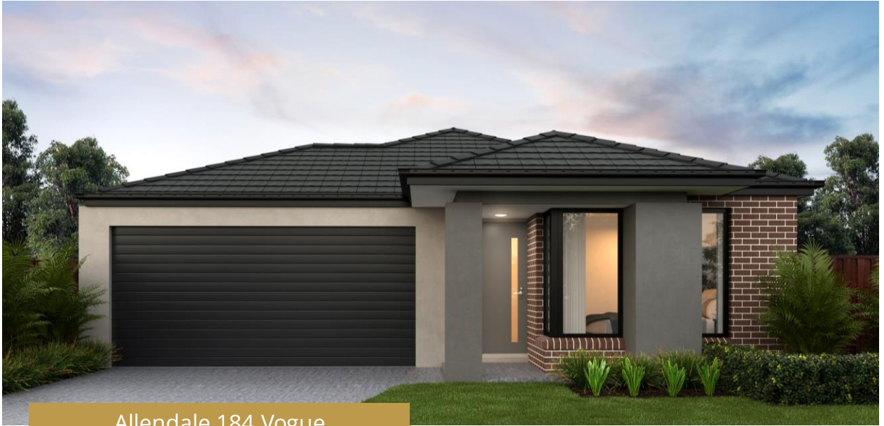
Allendale 184 Vogue