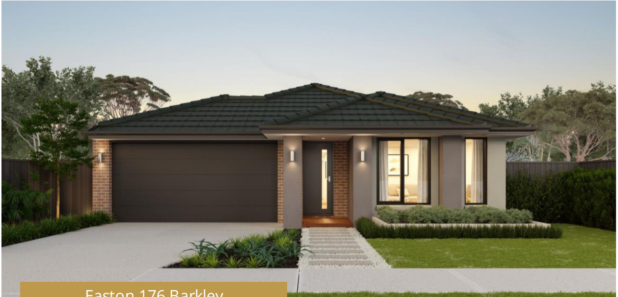
Easton 176 Barkley